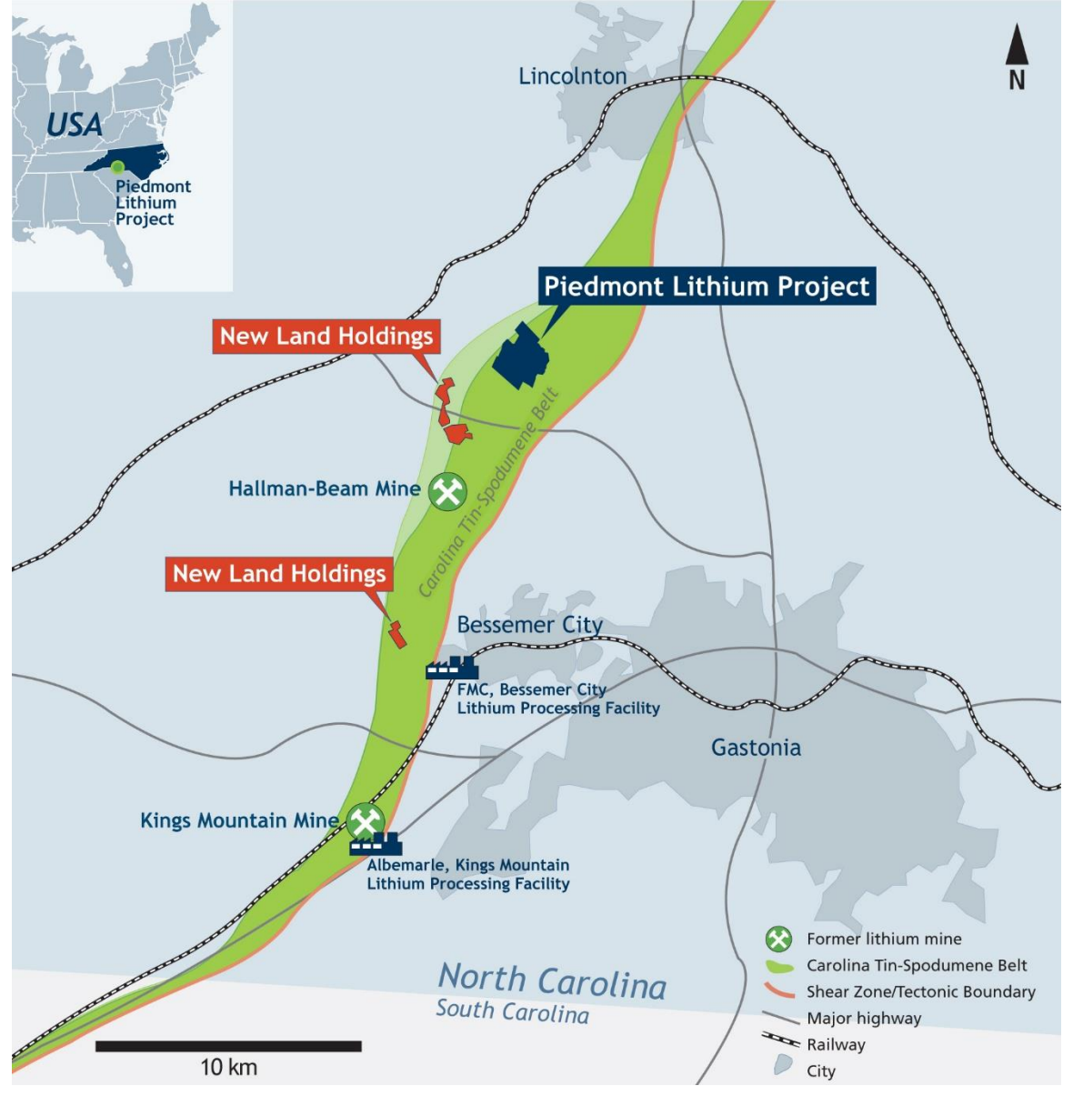
Piedmont Lithium Additional Land Option Agreements

Piedmont Lithium Limited ("Piedmont" or "Company") is pleased to advise that the Company has increased its lithium mineral rights by 147 acres through additional land option agreements signed with local landowners in the Carolina Tin-Spodumene Belt (" TSB ") in North Carolina, United States.