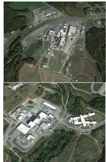
Piedmont Lithium Location and Bessemer City Lithium Processing Plant (FMC, Top Right) and Kings Mountain Lithium Processing Facility (Albemarle, Bottom Right)