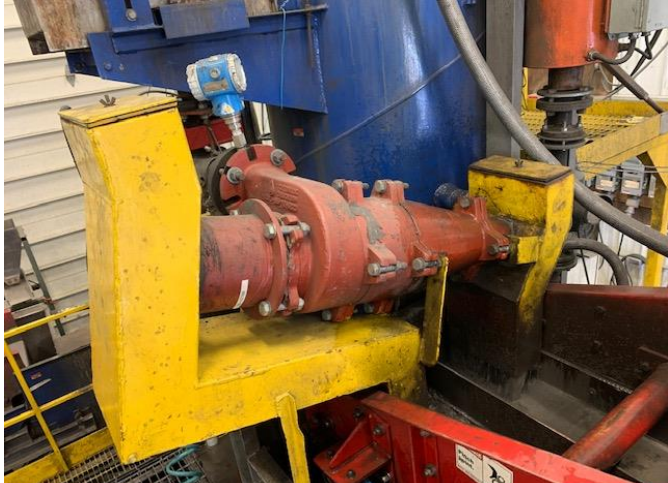
Figure 3 - Pilot Plant Setup at SGS Canada