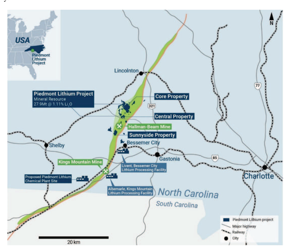
Piedmont Lithium Location in the Carolina Tin-Spodumene Belt

We also maintain a web site at www.piedmontlithium.com. The information contained on our website or available through our website is not incorporated by reference into and should not be considered a part of this prospectus supplement, and the reference to our website in this prospectus supplement is an inactive textual reference only.